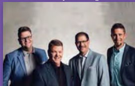
Down East Boys