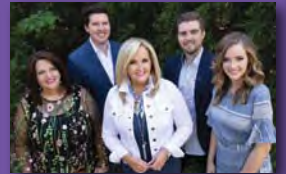
Karen Peck & New River