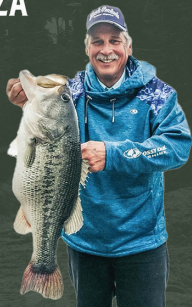
Outdoorsmen Extravaganza August 16