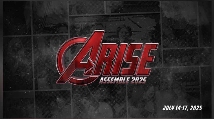
Arise Youth Conference July 14-17

YOU'RE INVITED TO THE OUTDOORSMEN EXTRAVAGANZA AUGUST 16, 2025