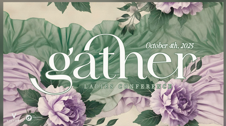
Ladies Conference October 4