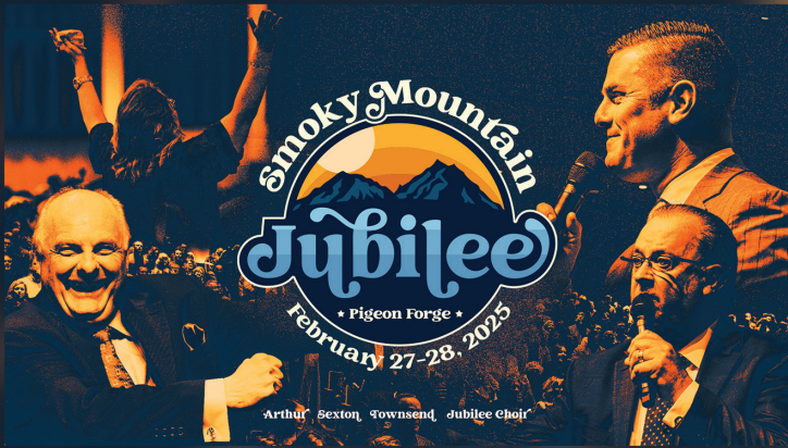
Smoky Mountain Jubilee February 27-28